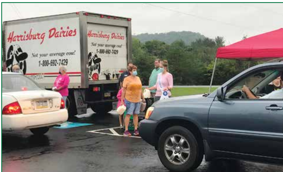
(Perry Valley Grange members pictured during a Grange sponsored drive-through milk giveaway)

Perry Valley Grange, in Perry County, has sponsored two drive-through free milk giveaways to help citizens in their community struggling with the effects of the COVID-19 pandemic. The projects had three goals – support a local dairy processing plant, help local farmers by increasing demand for their dairy products and provide nutritious food for fami-