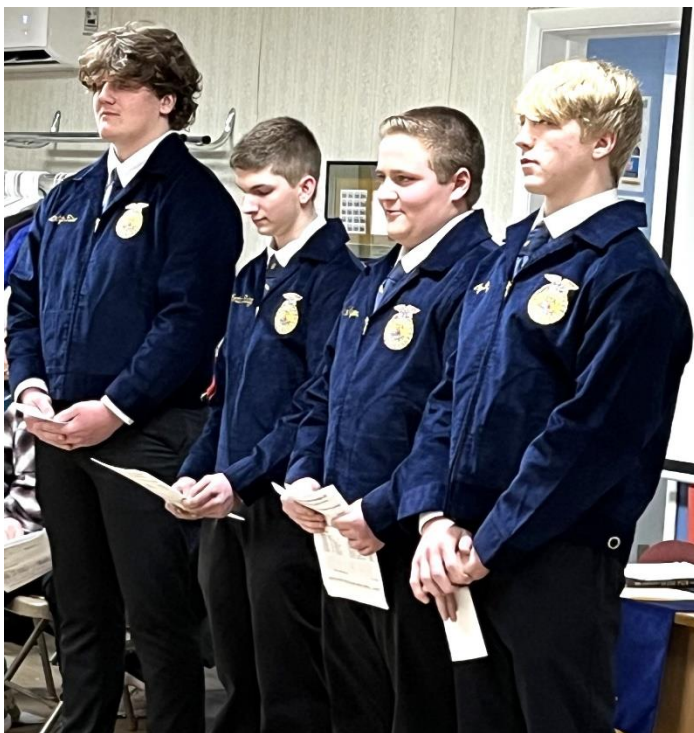
These four young men received their Blue Jackets at the PA Farm Show as they begin their FFA journey. Eagle Grange sponsored three of the jackets and was eager to hear each of them speak about their FFA involvement.