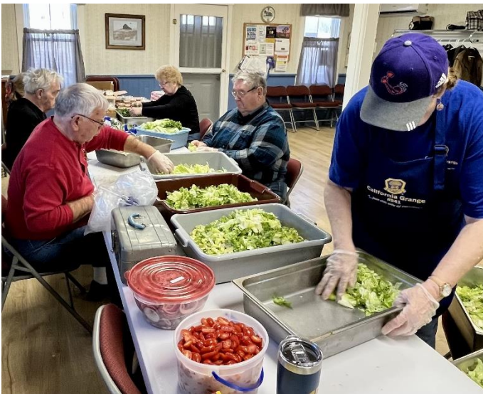
Assembly line of volunteers preparing tubs of salad