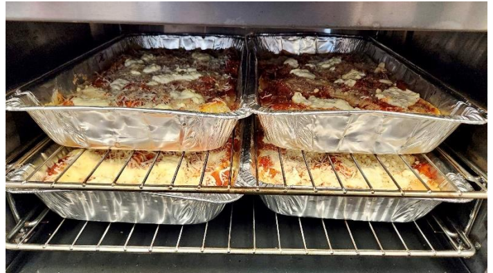
By 10 a.m. the first lasagna were baking in the oven.