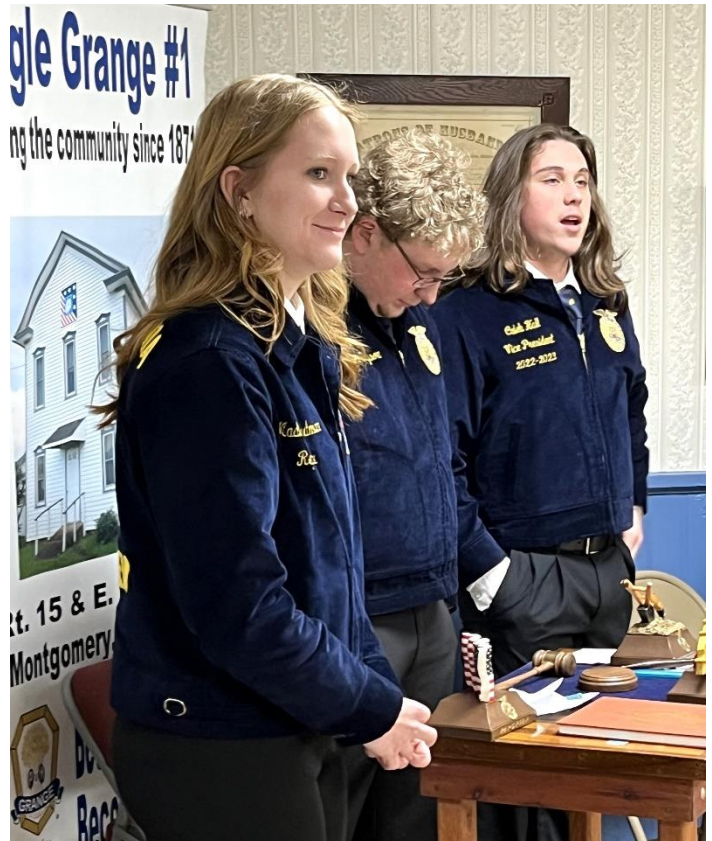
FFA officers (above & below) led a very well done and impressive demonstration of their meeting procedures. There were many similarities to the opening and closing ritual practiced by the Grange.