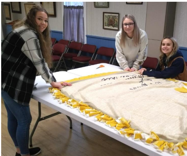
Three Montgomery FFA students also came by to help.